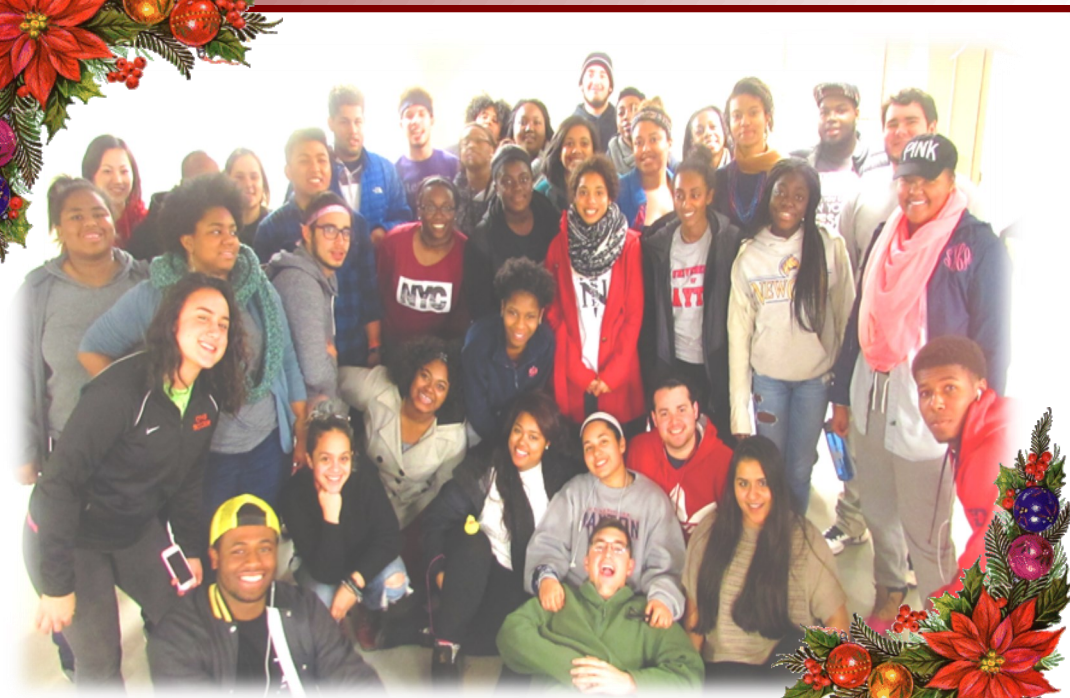
2015 OMA Retreat Participants